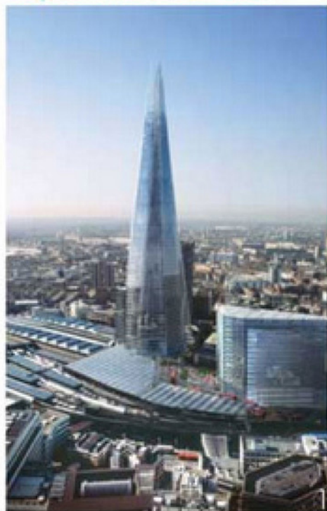
1 Shard Number 3, London, United Kingdom

The Sellar Property Group has commissioned architect Renzo Piano to design another tower as part of its regeneration of the London Bridge area. The 27-storey project is being dubbed Shard number three, as it will be Piano's third tower project in the area after his original 67-storey Shard, the tallest building in Western Europe, and the... Read more