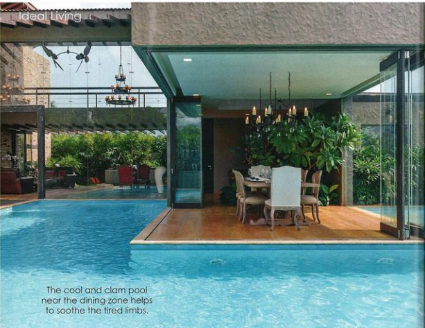
The cool and clam pool near the dining zone helps to soothe the tired limbs.