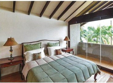
170 | November 2014 The Ideal Home and Garden

THE DESIGN What stands out in the villa is its open floor plan, compelling you to cherish the living-cum-dining-cum-swimming pool and deck areas, as an expansive lounge. Stylish ceiling lights not only add to the magic but also create an absolutely calming environment. On the first