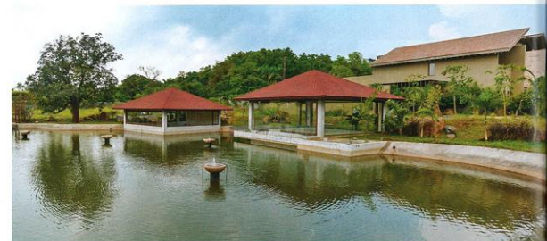
172 | November 2014 The Ideal Home and Garden